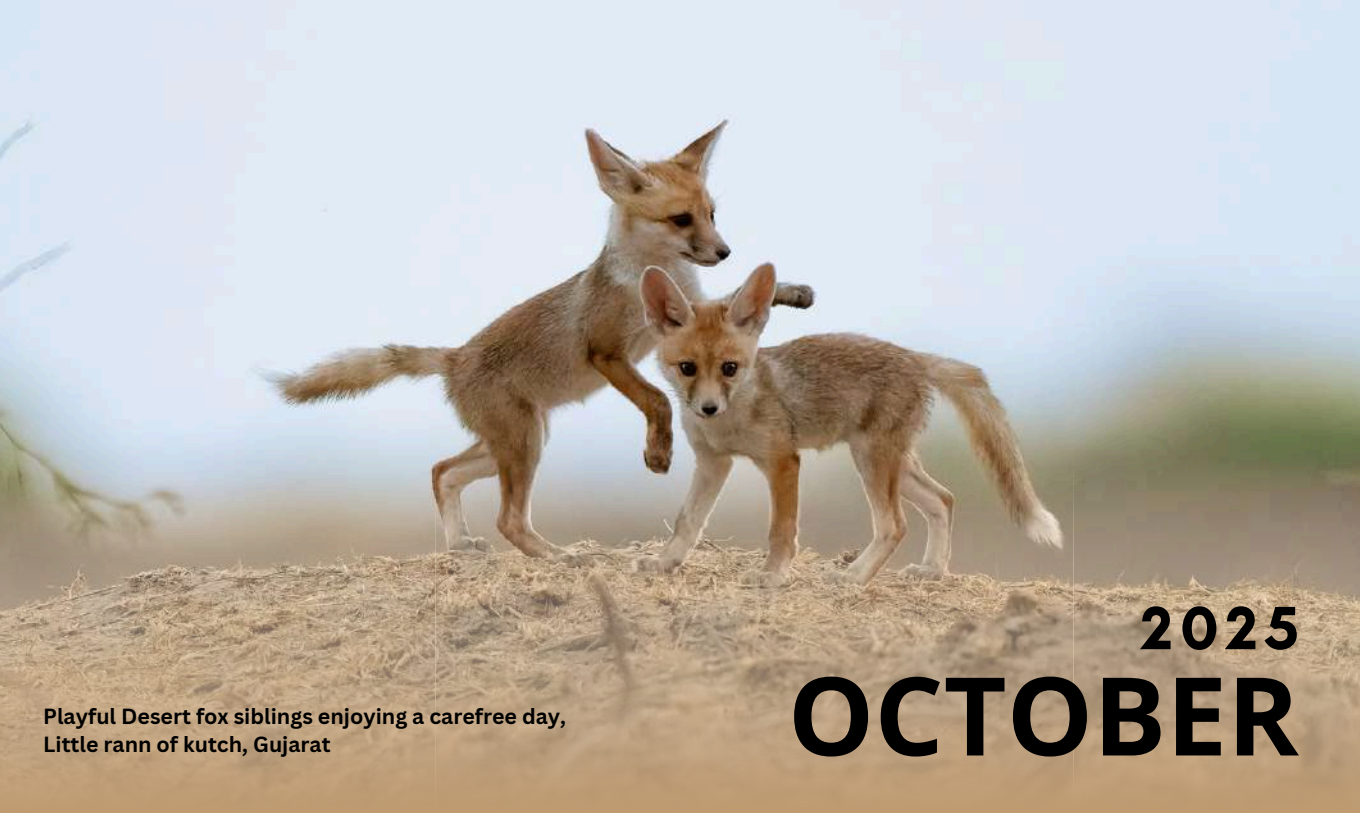
Playful Desert fox siblings enjoying a carefree day, Little rann of kutch, Gujarat