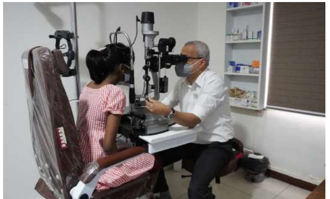
Detailed retina evaluation after sports injury

World Health Day is celebrated on 7th April. A picture of your retina can tell us about your general health also.