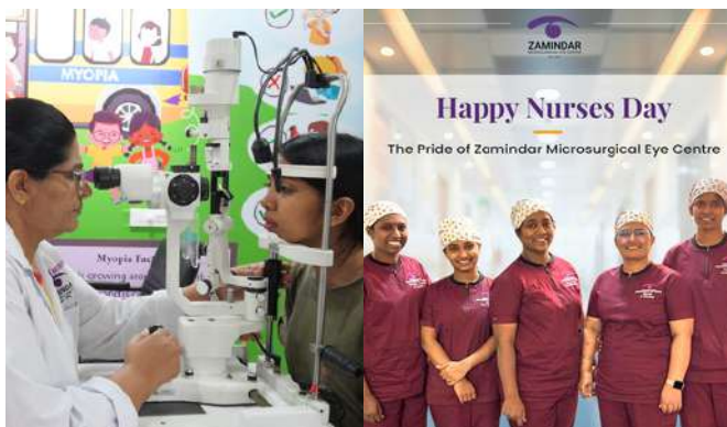
Our Myopia Clinic

Myopia is the most common ocular disease, affecting an estimated 20% of the global population. Early detection is crucial in preventing avoidable blindness. Our team conducts regular eye screenings in schools and colleges to detect conditions such as lazy eye and myopia.