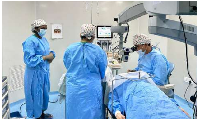
Our advanced cataract surgery facility

Modern Cataract Surgery allows you to choose intraocular lens which returns your youthful vision and gives you spectacle independence after surgery.