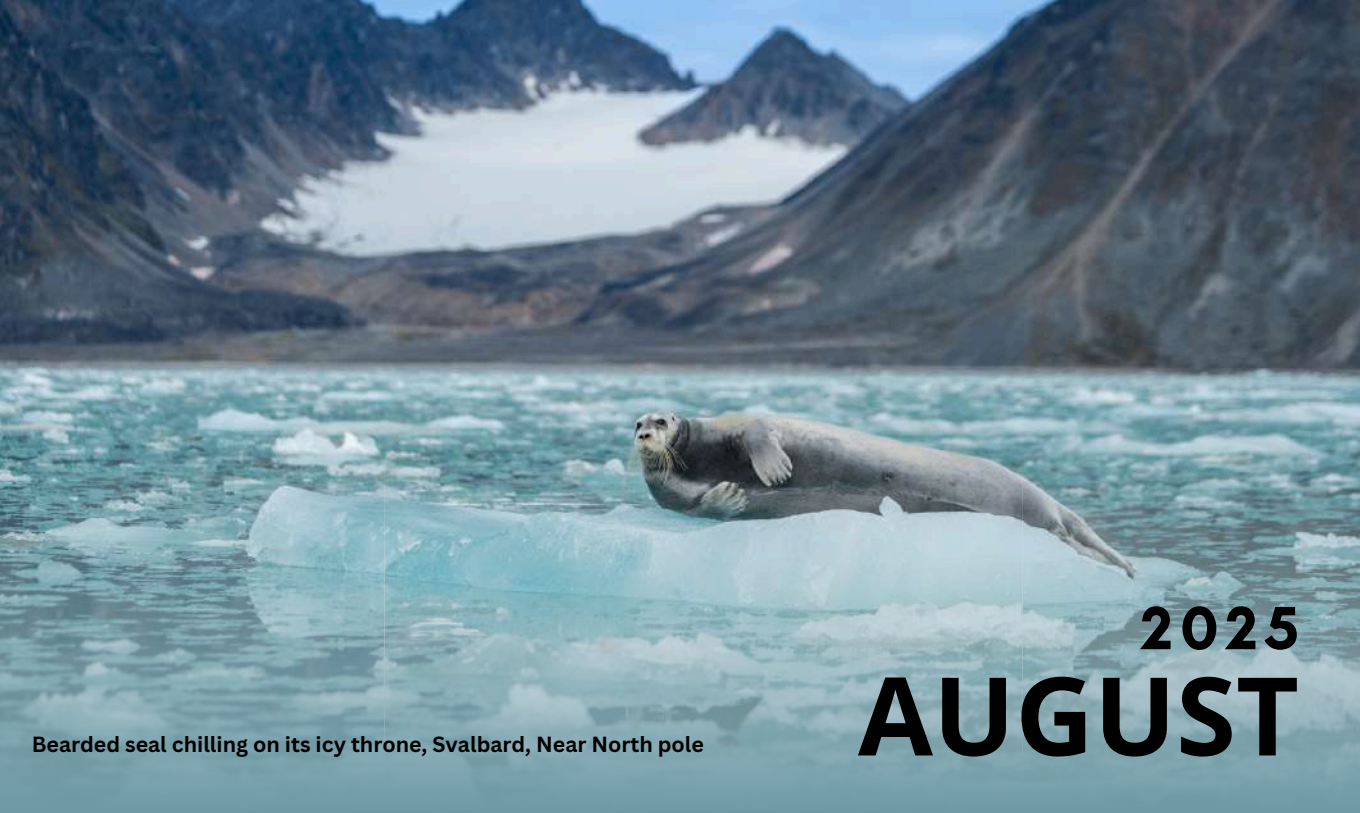
Bearded seal chilling on its icy throne, Svalbard, Near North pole