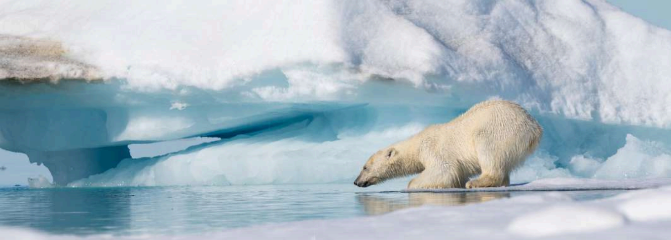
Hunting Pose of Polar bear waiting for a seal to come up to breathe, Svalbard, near North Pole