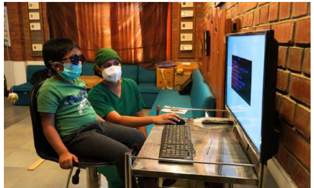
Our Vision Therapy clinic

Our dedicated Paediatric Ophthalmology Department takes care of children's eye care needs and our vision therapy department helps reduce eye strains, and improve vision in lazy eye conditions.