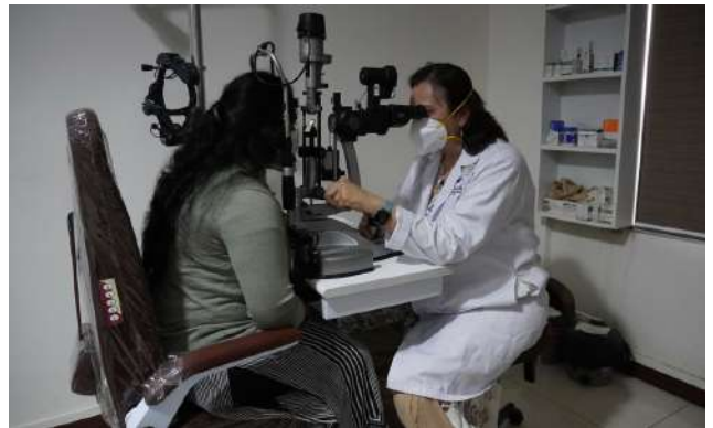
Our Glaucoma Department

In India, 11.2 million people suffer from glaucoma, and 1.1 million of them face blindness, including children. Intraocular pressure check-up annually is mandatory test for all above age of 40 years. Our Glaucoma family screening initiative encourages family members of glaucoma patients to come for screening to help early detection and treatment. This is the only way we can win this fight against glaucoma.