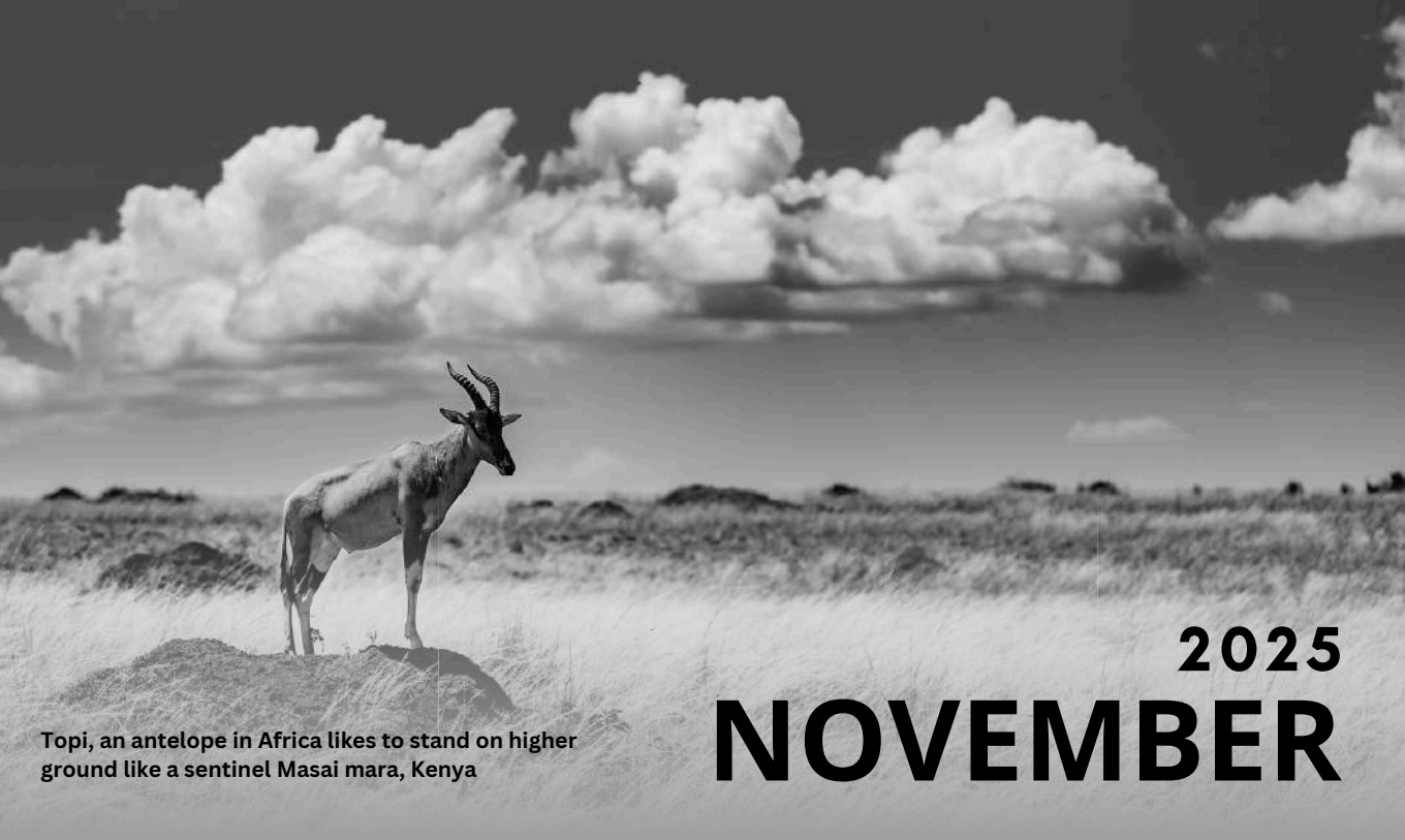
Topi, an antelope in Africa likes to stand on higher ground like a sentinel Masai mara, Kenya