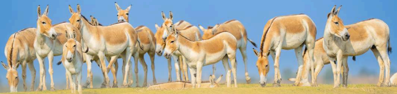
Herd of Indian Wild Ass seen at their Sanctuary, Little rann of Kutch, Gujarat