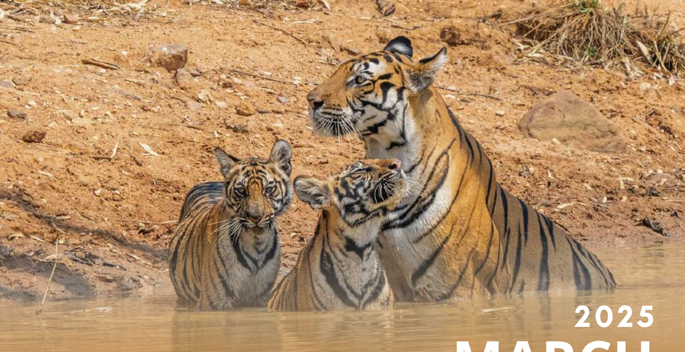
For her cubs, she means the world to them. Tigress with her cubs cooling off in summer heat, Bandhavgarh National Park, Madhya Pradesh