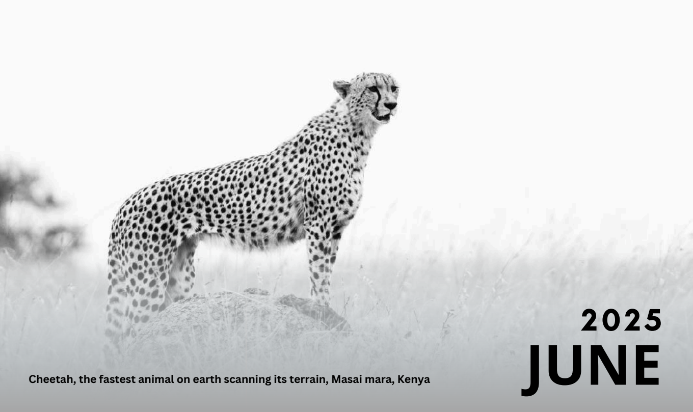
Cheetah, the fastest animal on earth scanning its terrain, Masai mara, Kenya