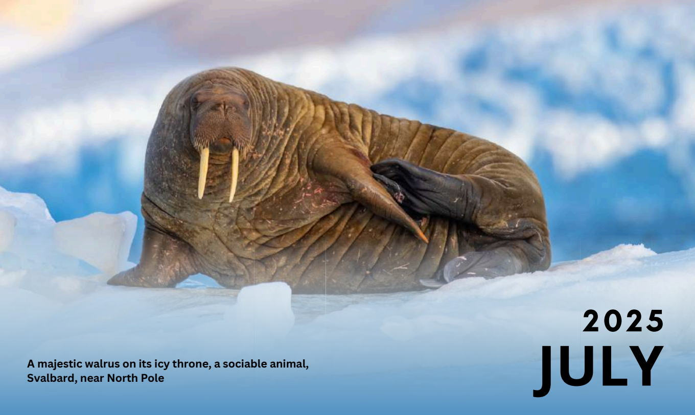
A majestic walrus on its icy throne, a sociable animal, Svalbard, near North Pole