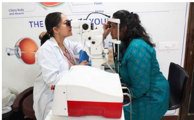
Our Retina Clinic

World Prematurity Day Nov 17th, Retinopathy of Prematurity is the major cause of preventable blindness in children, first one month after the birth is the golden time when this condition can be detected and treated.