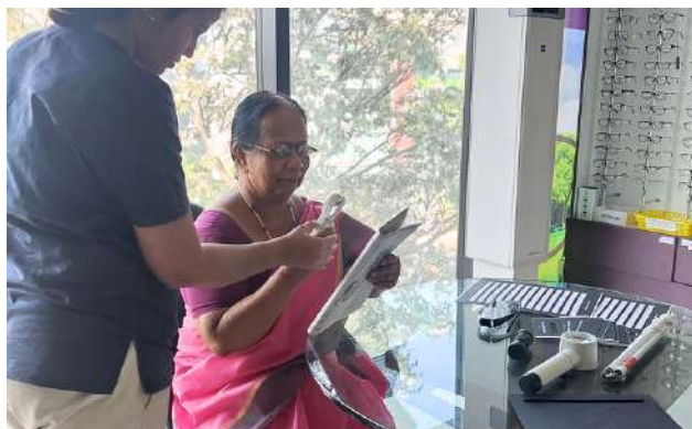
Low vision aids department

*Eating foods rich in omega-3 fatty acids are good for eye health.