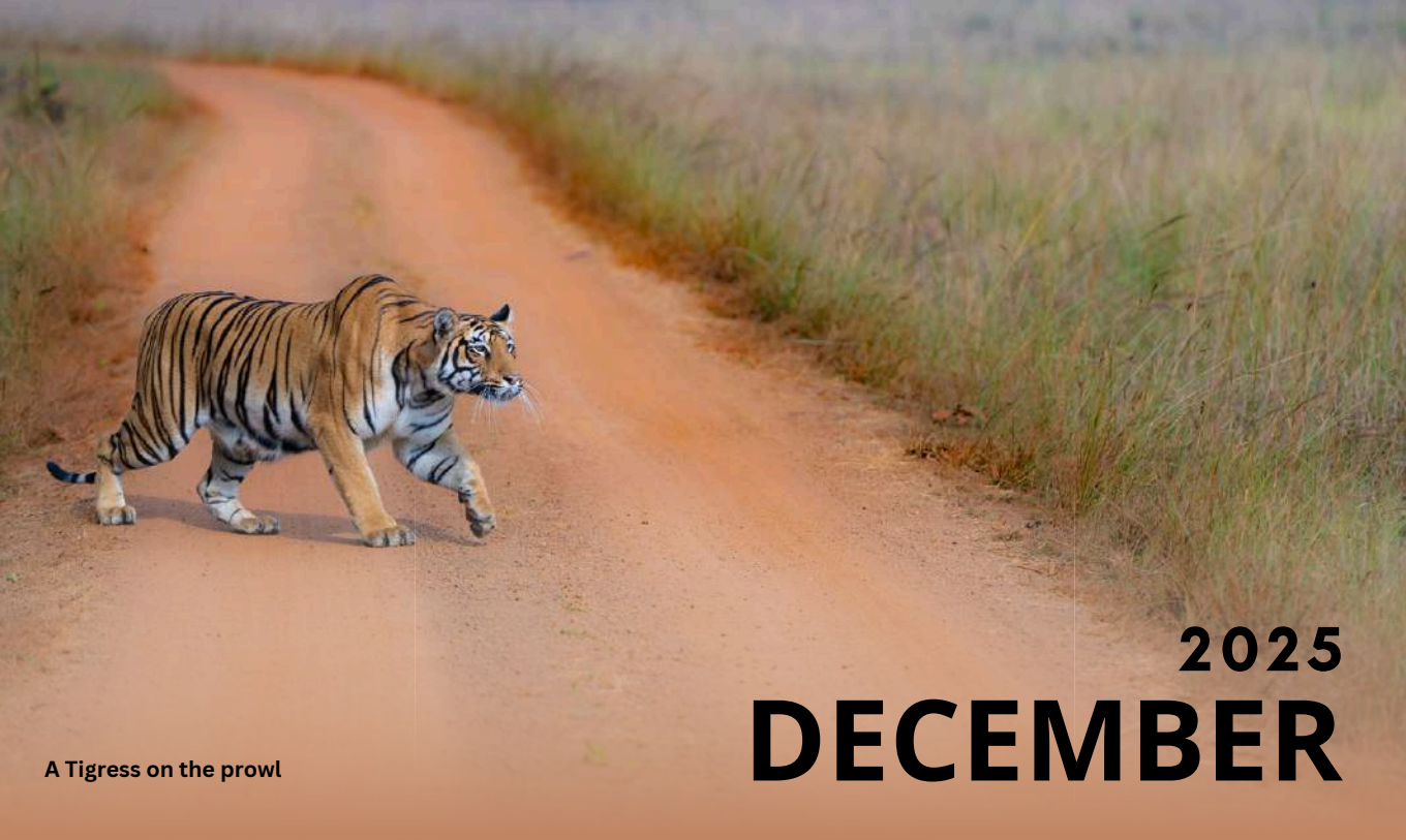
A Tigress on the prowl