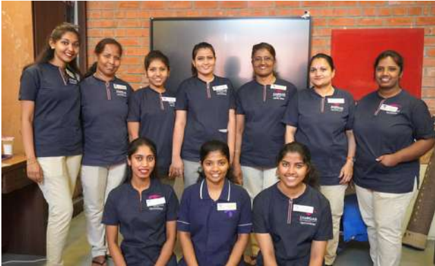
Our Optometrist team

World Optometry Day is celebrated each year to recognize the important role of optometrists and vision care providers in healthcare. We have a professional team of experienced optometrist for refractive check up and vision therapy to treat eye strain.