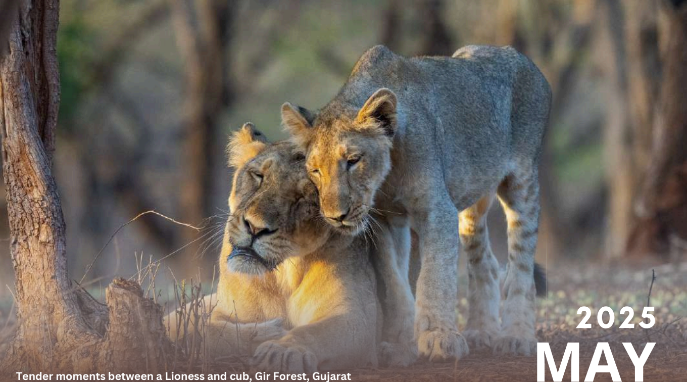
Tender moments between a Lioness and cub, Gir Forest, Gujarat