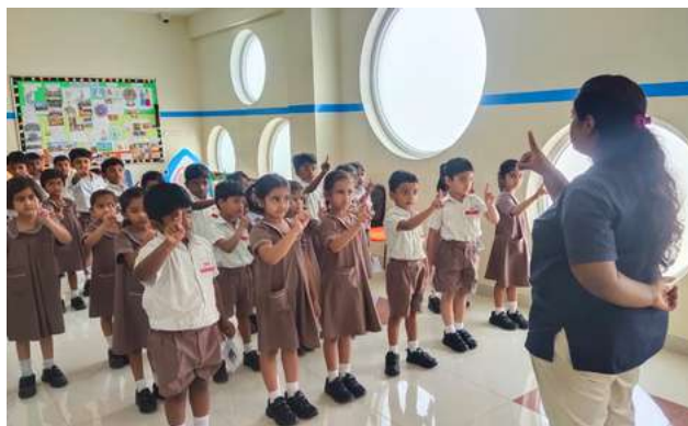
Our school eye-check up drive

World Sight Day reminds us to take care of our eyes and seek professional help if needed. Globally at least 1 billion people have near or distance vision impairment that could be prevented or has yet to be addressed. Vision impairment and blindness can have major and long-lasting effects on all aspects of life.